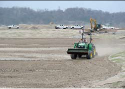
Site preparation for wetland mitigation, Cincinnati, OH