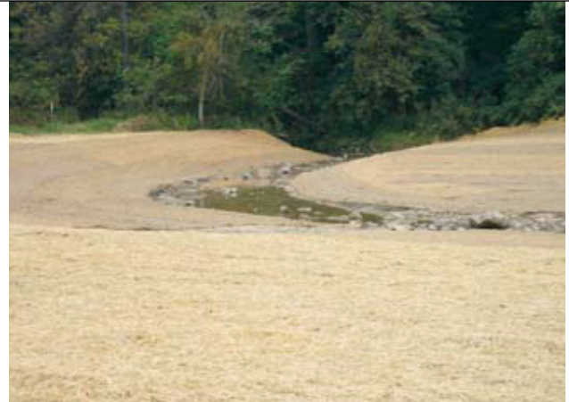
Streambank restoration after installation of seed and erosion blankets.