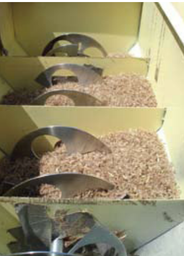
No-till drill seed box

Calibration of the drill is critical and complicated and requires continual monitoring during installation. Drill adjustment for proper depth of seed placement is also vitally important; adjustments to the drill need to be made on a site-by-site basis, and sometimes with differing soil conditions within the same site. You may wish to hire a firm who specializes in native seed drilling. Many seed dollars are wasted and many projects unsuccessful due to improper knowledge of drill operation.